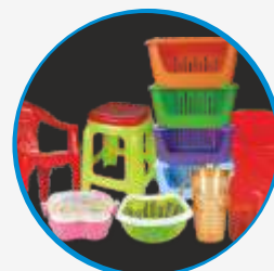
House Hold Items