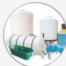
Roto Moulding Items