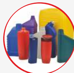
Blow Moulding Items